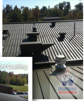
After AWS Custom Tint Coating