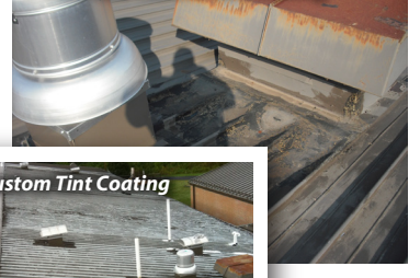
Before AWS Custom Tint Coating